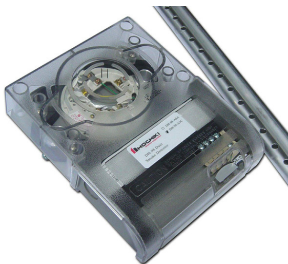
Duct housing with an SLV-AS analogue photoelectric sensor